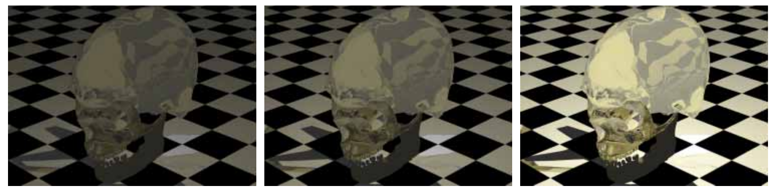
Figure 5-48: Varying the lighting Intensity controls the strength with which it shines: 64 (left), 127 (centre) and 510 (right). Compare these results with the centre render in Figure 5-46, set at the default Intensity of 255.

more subtle lights and higher values produce very intense lights. With Intensity values greater than 255, the shading on objects becomes progressively sharper i.e. the transition zone between light and dark areas on the object becomes narrower. It is the shading on objects that gives the illusion of depth in a two-dimensional picture. Consequently, if the shading between areas of the object that are light and dark is reduced, the illusion of depth in a picture will diminish.